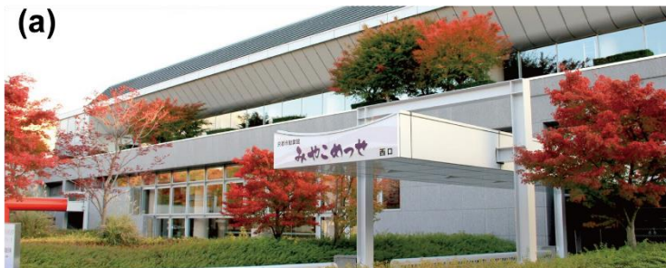
Fig. (a) Miyako Messe, (b) Participants and presentations in recent ISS